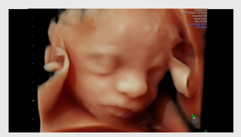
Obtain another perspective of structures from increased depth perception and anatomical realism with HD live<sup>™</sup> technology - an essential problem solving tool

Explore 3D Printing for rapid clinical prototyping, research, and parent bonding